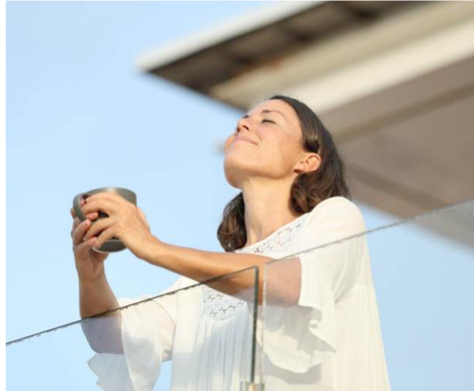
Sun shading elements (balconies & perforated panels)

Extensive landscaping with native plants or adaptable species enhances the property's beauty and value while reducing its environmental impact. Other environmentally friendly features include advanced waste management and water reuse solutions, as well as a bicycle storage area and EV parking to encourage residents to use less traditional combustion engines.