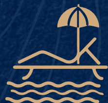
A luxurious and large Leisure Pool Deck