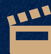
Rooftop Outdoor Cinema