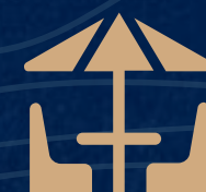
Roof Top Lounge