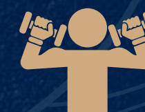
Outdoor & Rooftop Gym