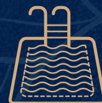
Private pools inside apartments