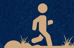
Rooftop Jogging track