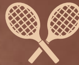
Squash & Tennis Court